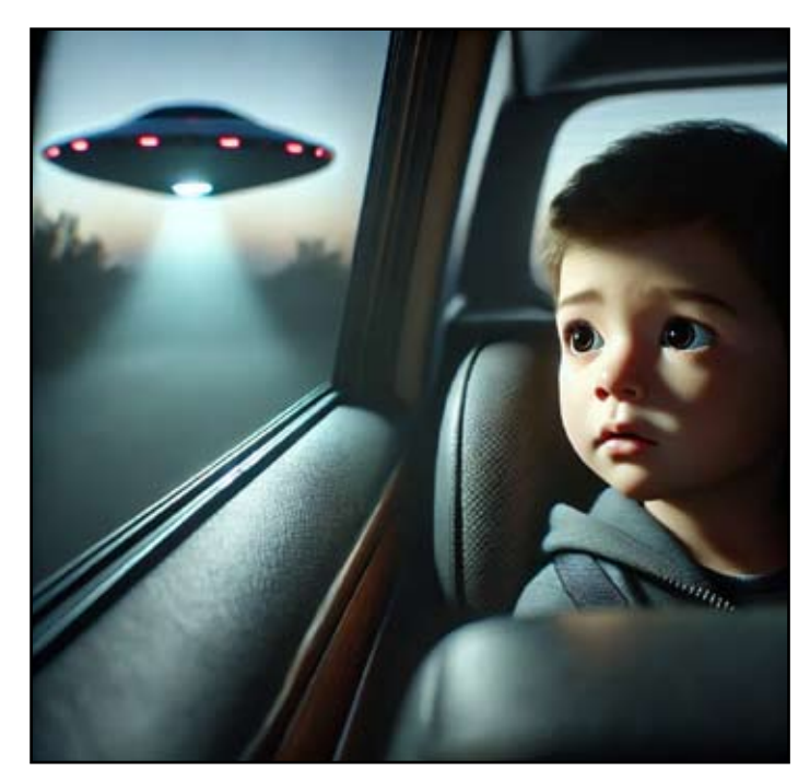
As a young child, Rick saw a UFO out of his car window, helping to shape his fascination with unexplainable phenomenon.

After conducting some field tests, we determined that what looked like a giant reptilian alien being in the photograph wasn't that at all, but instead it was a giant evergreen tree. And what appeared to be two eyes were actually a couple of pinecones sitting at the very top of the tree. In the instance of the shadow in the photo that was shaped